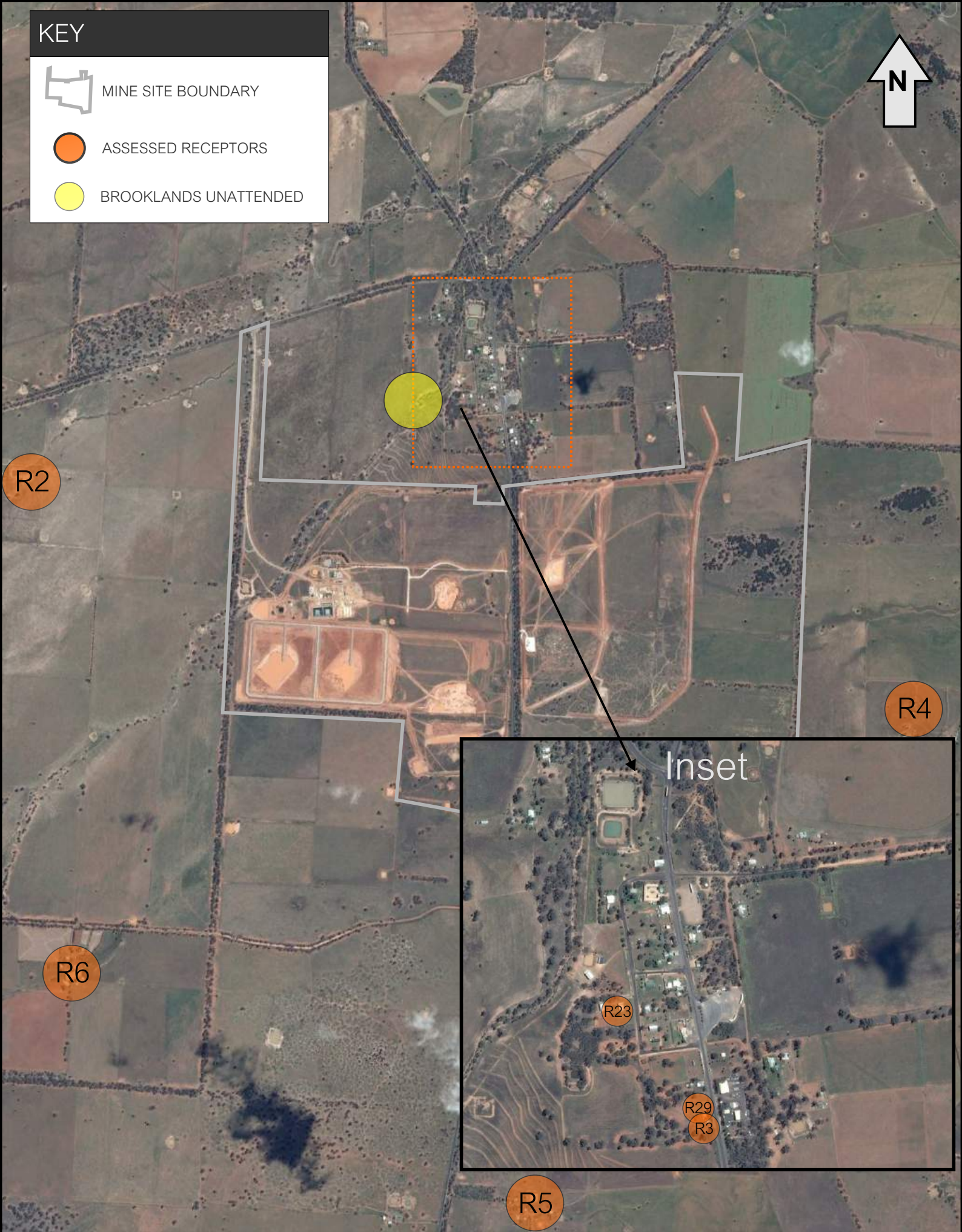
FIGURE 1 - LOCALITY PLAN AND ASSESSMENT LOCATIONS

TOMINGLEY GOLD MINE EPL NOISE MONITORING